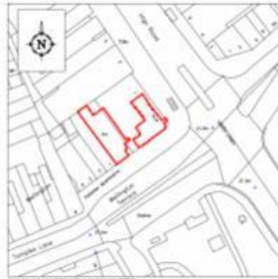
Location plan Scale 1:1250